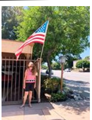
A moment of silence 5/25/20 3:00 pm GOD BLESS AMERICA